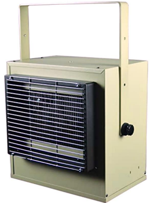
Specific Characteristics 5700 Series Confined Space Plenum Rated Heater, Bracket and Thermostat

Manufacturer's Limited Warranty: 1 Year.